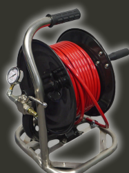
1/4" MINI-HOSE & REEL