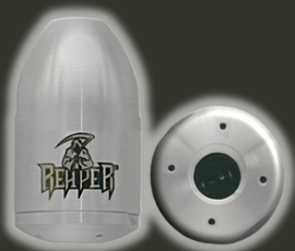
1/4" REAPER ATTACK NOZZLE