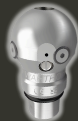
3/8" WARTHOG NOZZLE