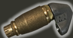
1/4" ROOT RANGER NOZZLE