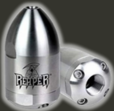
3/8" REAPER ATTACK NOZZLE