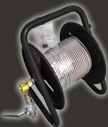
3/16" TRAP-HOSE & REEL